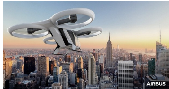
CityAirbus – an urban air taxi for mega cities. Endurance: 15 minutes (Airbus Press Release 2017)

Electric air mobility may become useful in some areas of aviation. Small short-range general aviation aircraft may benefit from battery-electric or hybrid-electric propulsion. Urban air mobility in large cities will give time advantages to super-rich people, but mass transportation in cities will require a public urban transport system. Battery-electric passenger aircraft are neither economic nor ecologic. How overall advantages can be obtained from turbo-electric distributed propulsion (without batteries) is not clear. Maybe turbo-hydraulic propulsion has some weight advantages over the electric approach.