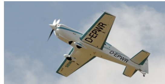
Extra 330LE with electric 260 kW engine. Endurance: 20 minutes.